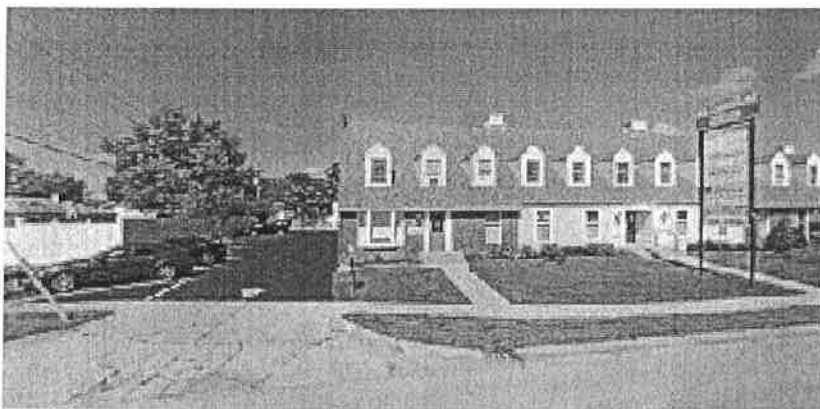
2801 N Oakwood Ave